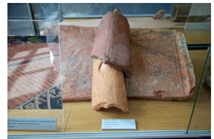
Roman roof tile