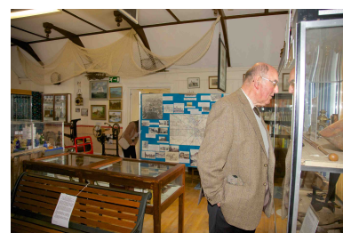
Redecorated Main Display Room