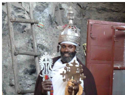
A priest of the Orthodox Ethiopian church showing his ornate crosses, particular to certain areas of the country

After a short break Adrian Fox showed a very interesting video of