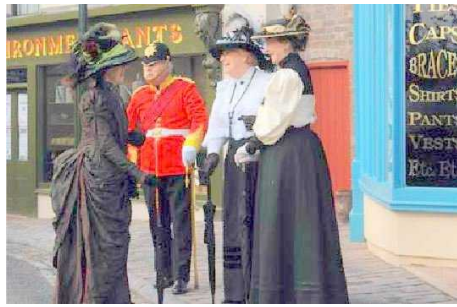
Blists Hill Victorian Town