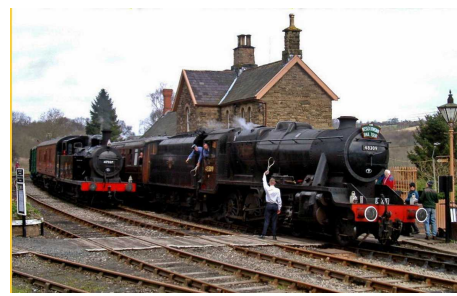
Severn Valley Railway