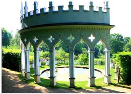
Painswick Rococo Gardens

We now have 35 members booked for the 3 night, 4 day holiday to Shropshire, including Painswick Rococo Gardens, Ironbridge, Blists Hill Victorian Town, the Coalport Museum, Ludlow, The Severn Valley Railway and Stourhead Manor.