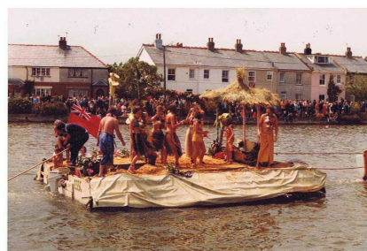
Silver Jubilee Water Carnival celebrations

MP who spent time looking at the photographs and documents showing how Emsworth people celebrated the Coronation in 1953 and Jubilees in 1977 and 2002. As he left he commented that when ever he visits Emsworth Museum he always learns something new.