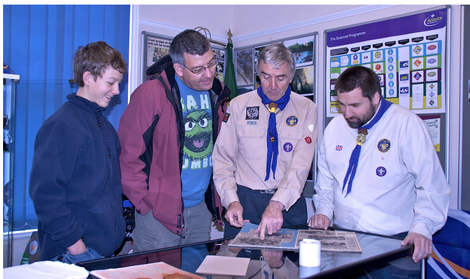
Scout Leaders look through old photographs and go down memory lane

To celebrate the 90th anniversary the Group ran a number of special events culminating in a celebration in November. We now look forward to our 10th decade and our Centenary. We take our scouting seriously in Emsworth. Since 1919 we have been providing a successful program to our members who are now from 6 years old and upwards, both boys and girls. Our Group is growing all the time and is now 165 members strong with a long waiting list! We must be offering a successful program to our members, delivered by a highly qualified and experienced Leadership team. In recent years we have had four members achieve their Queen Scout Award and attend the St George's Day parade at Windsor Castle. We have had groups camping in Kanderstag, Switzerland and Poland as well as members taking part in