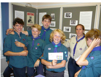
Junior Group Winners.. Scouts 3 and 4