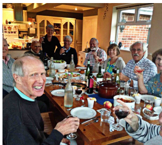
Spanish Group Outing

To celebrate the 10 years that they have been active in Emsworth the Ems Valley U3A are delighted to be able to share their enthusiasm for learning with the wider Emsworth community.