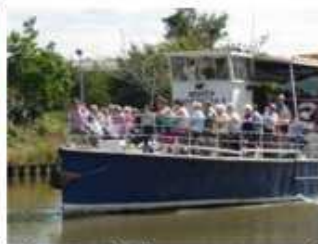
Glos and Sharpness Canal