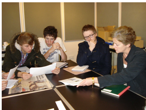
Research at the Museum