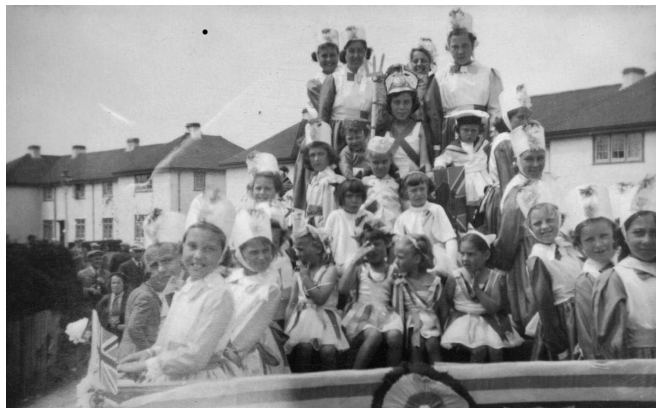
Auntie Pat's dancing School float at the Coronation parade in 1953.

Always endeavouring to present the Museum's archives of people's memories of their life and times in Emsworth in an interesting way, we are currently filming volunteers' reminiscences.