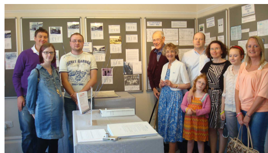
Emsworth People Over Seven Decades