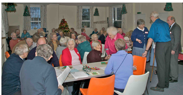
The Stewards' Christmas Tea Party