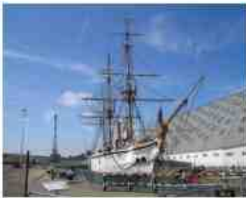
Chatham: HMS Gannet