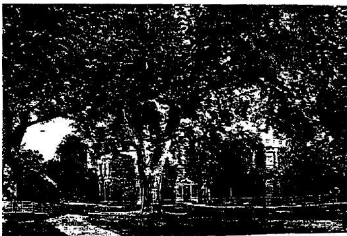
The Padwick Manor House, 19 th century.