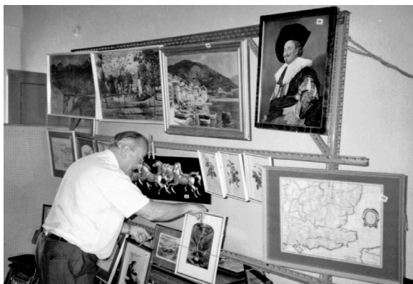
Preparing for the public auction in 1988