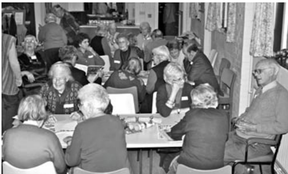
Stewards at the Museum's 2008 Christmas 'thank-you' tea party

Museum stewards enjoyed themselves at the 2008 Christmas party held in the Emsworth Centre, South Street. This regular event is just a small 'thank-you' for the immense contribution they make to the running of our Trust. Without them, the museum just could not function.