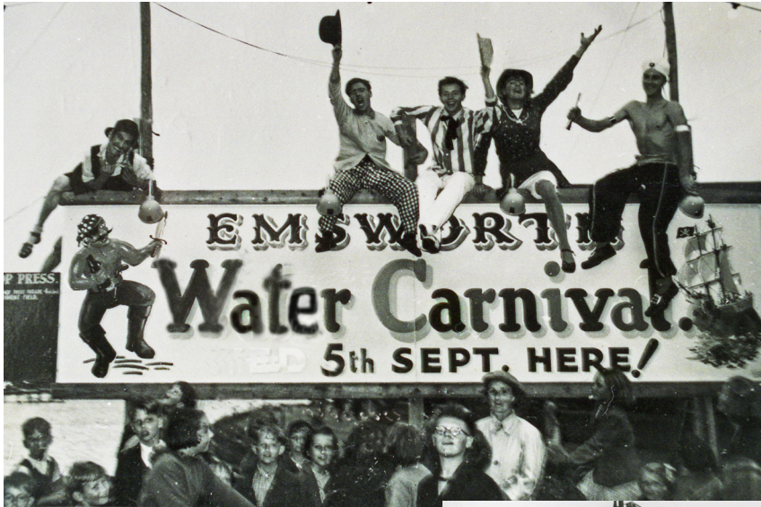
Hoarding, left, advertising the 1951 Emsworth Water Carnival which was revived in 1953 for Her Majesty Queen Elizabeth II's Coronation and again in 1977 for her Silver Jubilee