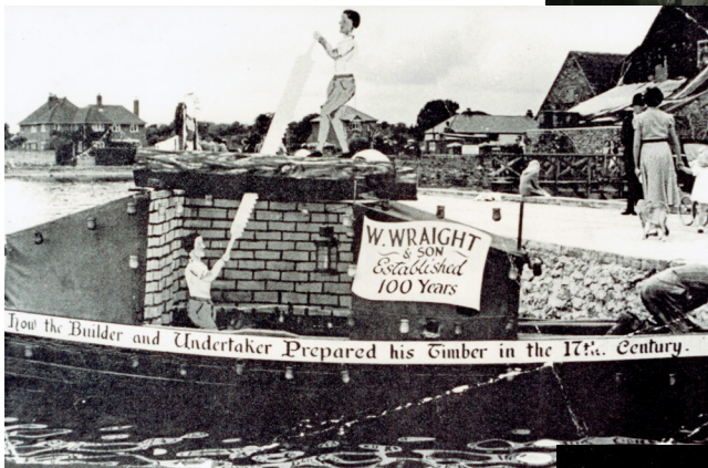
Prizes have always been awarded for decorated boats. In 1919 a distinction was made between fishermen's boats and other boats while in 1951 other categories such as trade entries were added