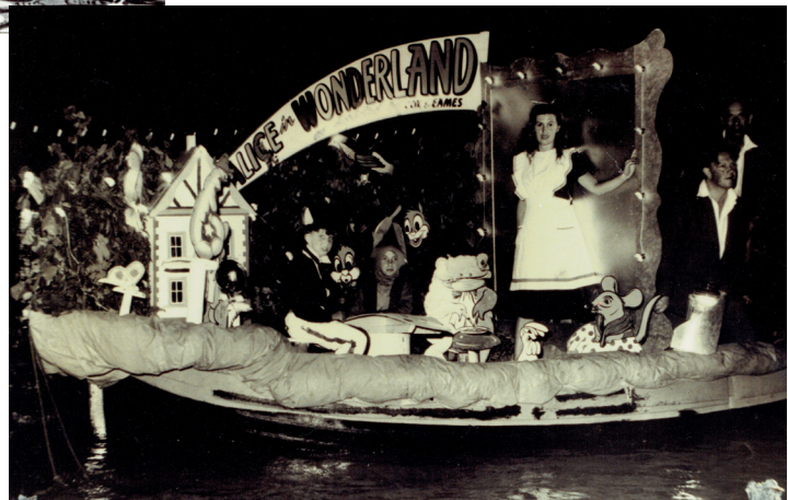
Fancy dress competitions, swimming races, water polo contests, a tug of war with rubber tubes, all have featured in the daylight activities of the carnivals