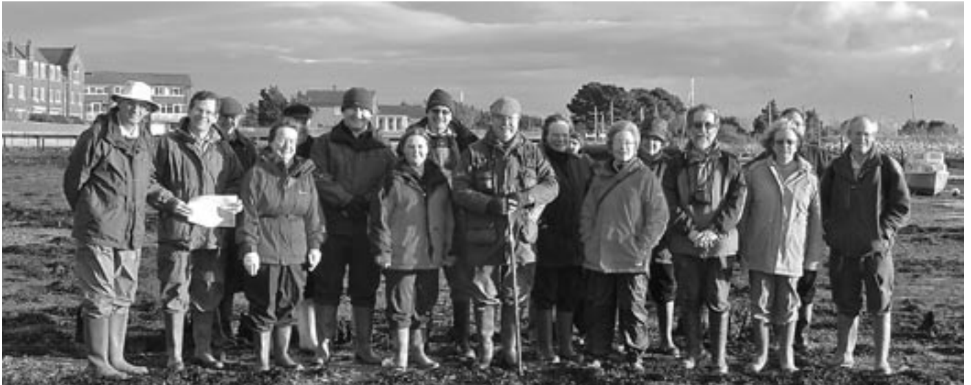
The volunteers on site