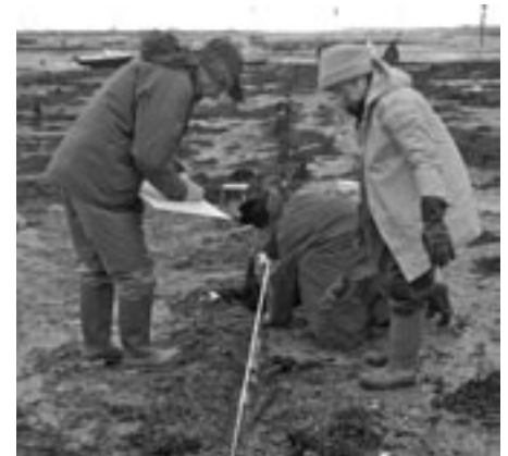
Field work started in January