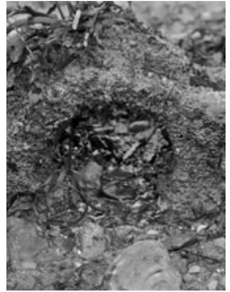
Evidence of concrete (above) and brick (below) on the site. More details in our exhibition