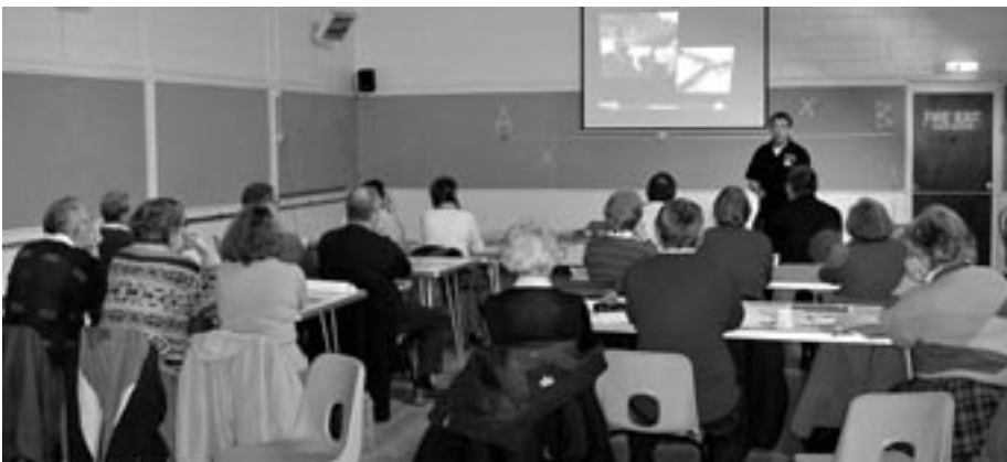
Training for the survey work took place in early December 2007

In January and February this year the team has undertaken the work involved in mapping the beds and looking at evidence to help us understand their construction.